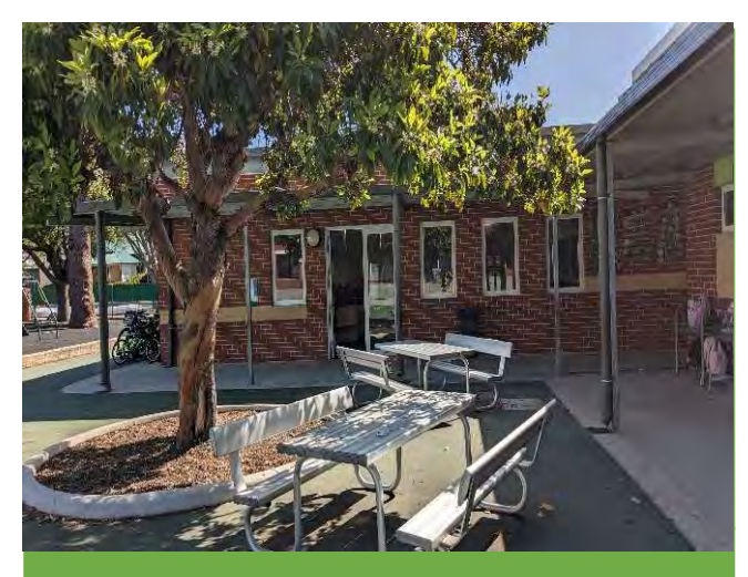
4. I will visit the library.