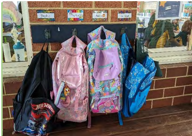
1. I will have a new classroom. This is where I hang my bag and line up.