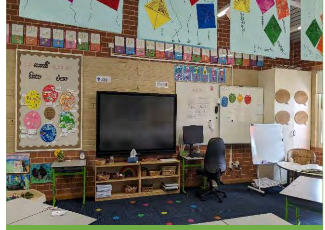
2. This is where I will learn in the classroom.